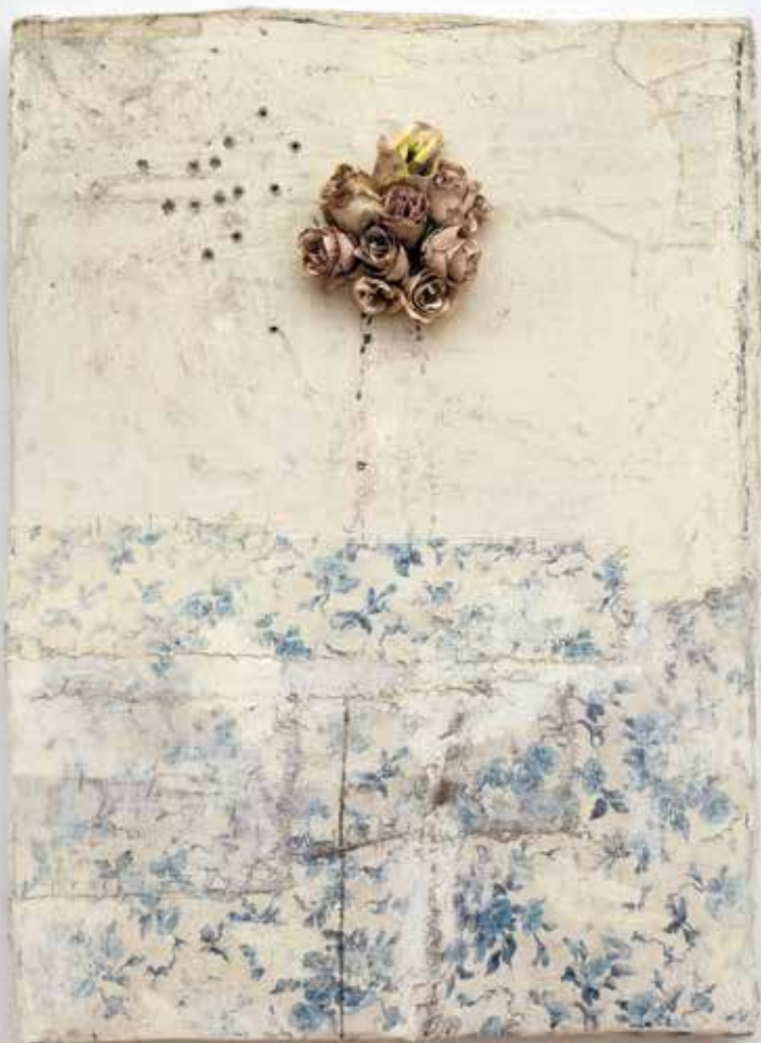
Untitled , 2014/17 Oil, wax, house paint, plastic flowers and canvas fabric on wood. 64.5 x 47.5 x 7 cm

What interests me the most is expressing what's in nature, in the visible world, that is. Giorgio Morandi