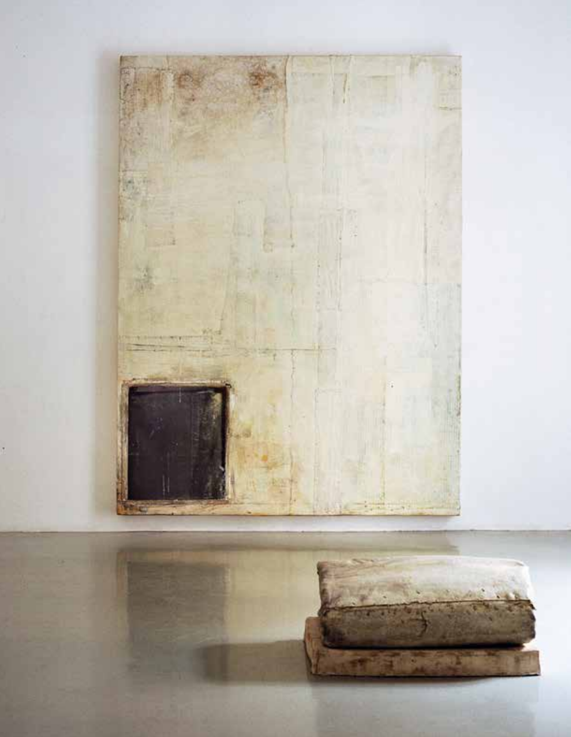
Cloud , 2003 Oil and wax on canvas, wood. 52 x 68 x 32 cm (floor) Installation: Lawrence Carroll , Studio Trisorio, Napoli, Italy, 2004