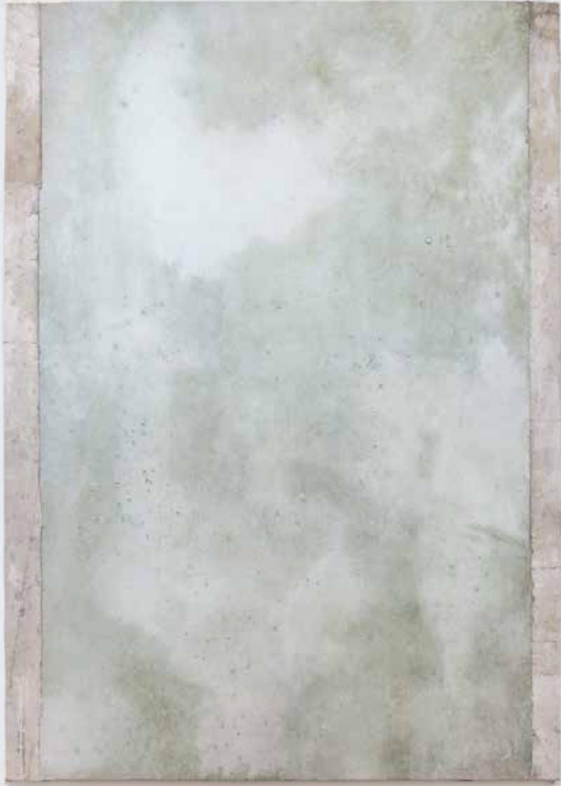
Untitled , 2016/17 Stain, house paint and canvas on wood. 300 x 190 x 4 cm Installation: Permafrost , Fox Jensen, Alexandria, Sydney, 2019