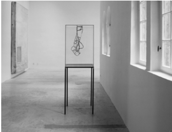
Untitled, (cocoon painting) 2014/17 Corrugated paper, oil, tape, house paint, glue and wire. 40 x 14 x 13 cm Installation: Kunstmuseum Magdeburg, Germany, 2018