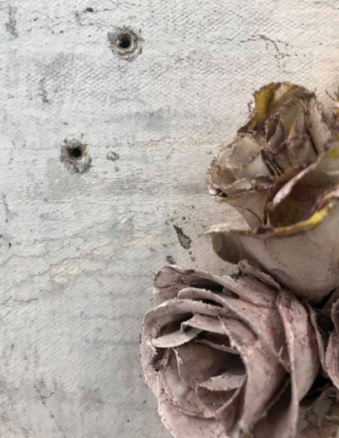
Untitled , (detail) 2014/17

Oil, wax, house paint, plastic flowers and canvas fabric on wood. 64.5 x 47.5 x 7 cm