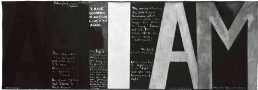
Colin McCahon. Victory over Death 2 , 1970 Synthetic polymer paint on unstretched canvas. 207.5 x 597.7 cm